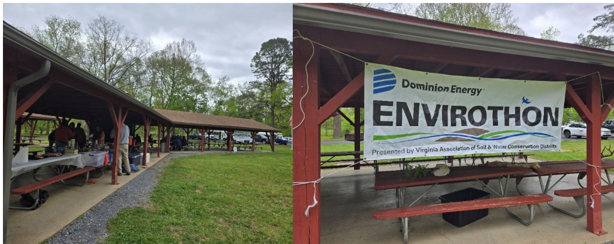
Pictured above: Envirothon event at Grand Caverns.